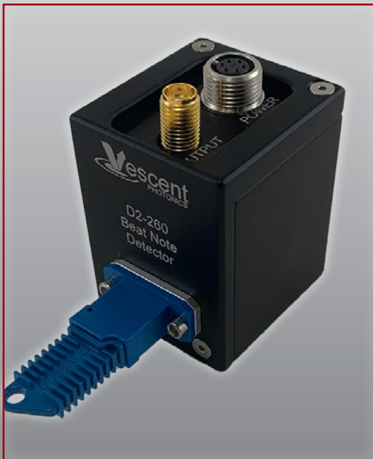
D2-260 Beat Note Detector

The D2-260 is compatible with the Vescent D2-250 Heterodyne Modules and the D2-135 & ICE-CP1 Offset Phase Lock Servos. In combination, a true phase lock between a pair of lasers with a user-defined frequency offset can be established.